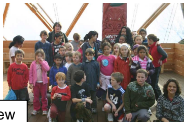
Here we are enjoying the new Caves building and pou.

The Ministry of Education funded bus transport route will continue to remain the same as it is now. They have ended the review and our run will be reviewed again in 2012. There is a bus report that the Board will circulate to everyone as soon as possible.